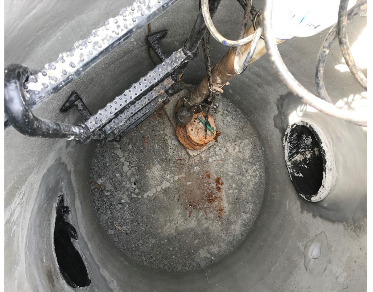
Underground storm catch basin