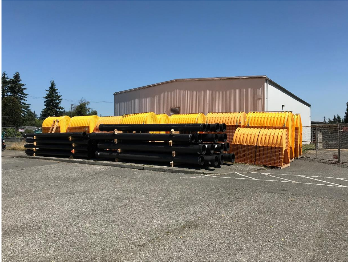
Future underground storm system